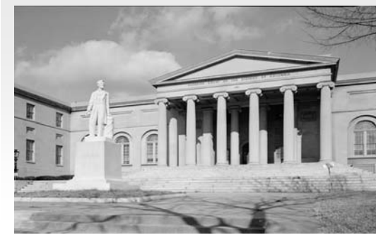
Historic drawing and photo courtesy of the DC Preservation League